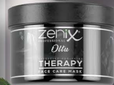
• OLTU • Clay Effect