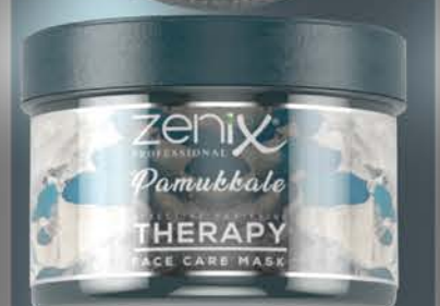
• PAMUKKALE • Clay Effect