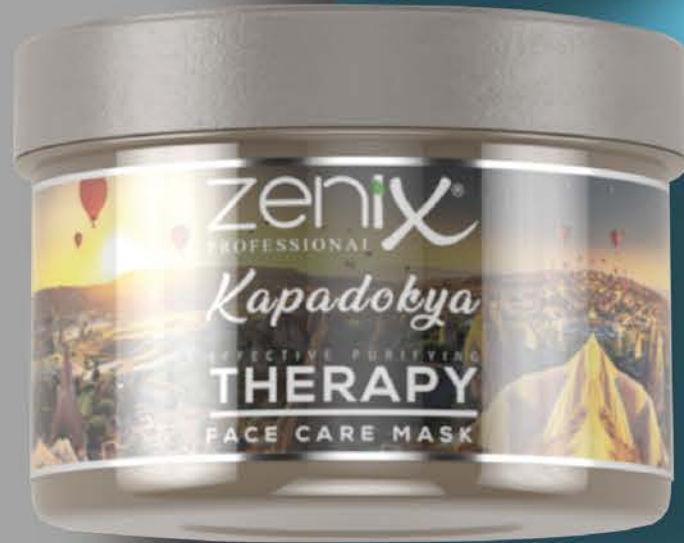
• KAPADOKYA • Clay Effect

This mask is used to remove debris from under the skin, reduce pore size and improve skin tone.