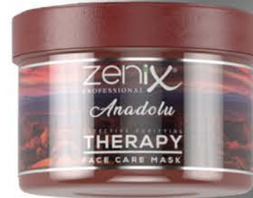
• ANADOLU • Clay Effect